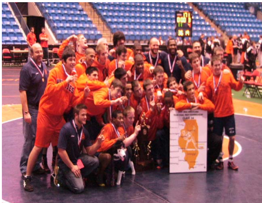
2009 IHSA CLASS 3A STATE CHAMPIONS

Support OPRF Wrestling by Dobating to the Wrestling Family